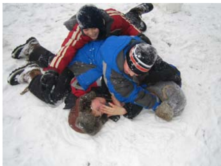
A Pile 'o' Webelos!