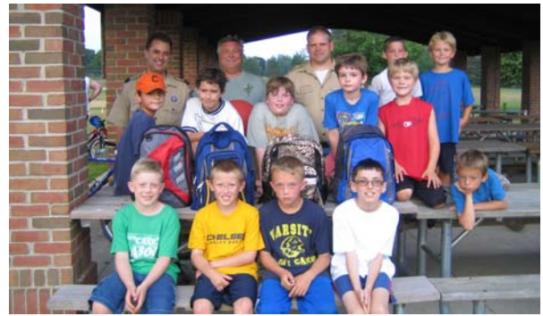
Filling Back-to-School Backpacks for Kids in Need (And Having Fun at the Pack Picnic & Bike Ride)