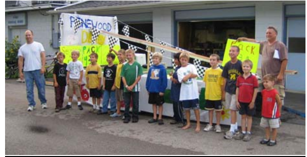
Building the Float