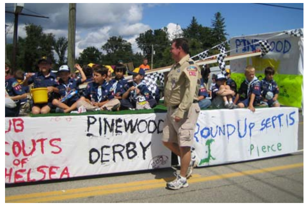
Marching in the Chelsea Fair Parade